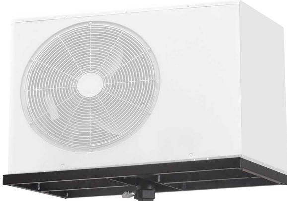
BC-02/M Loading platform 80 x 40 cm (NOT INCLUDED)