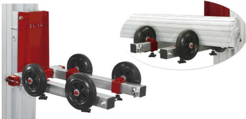
ACT-06 ADAPTOR FOR ROLLER DOOR & WINDOW SHUTTERS