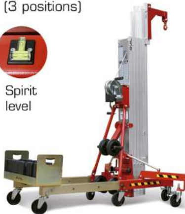
Legs can be inserted in the front or back of the tower for positioning close to walls.