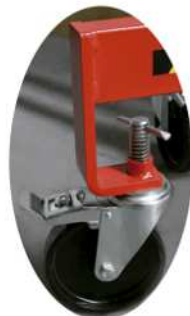
Ø150mm adjustable wheels for perfect levelling.