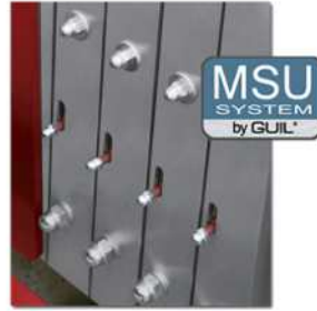
Mast Section Unblocking System (MSU)