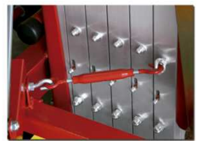
Adjustable mast blocking system for horizontal transportation.