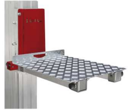
ACT-04 LOAD PLATFORM