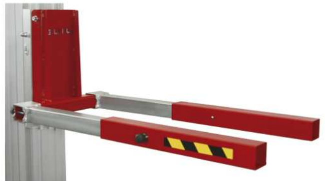
ACT-02 FORK LENGTHENERS