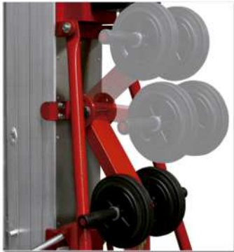
Adjustable manoeuvring handle with Ø200 mm wheels included. (3 positions)