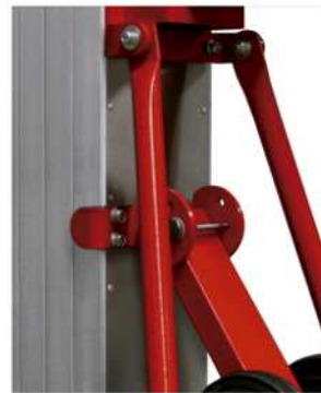
2 Stabiliser braces for greater lift stability.