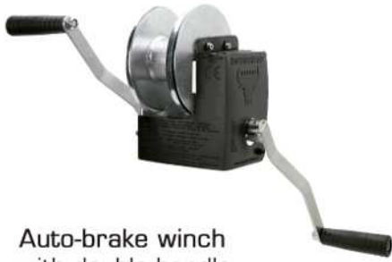
Auto-brake winch with double handle. CE Machinery Directives

TORO MATERIAL LIFTS ARE EQUIPPED WITH TWO SAFETY SYSTEMS