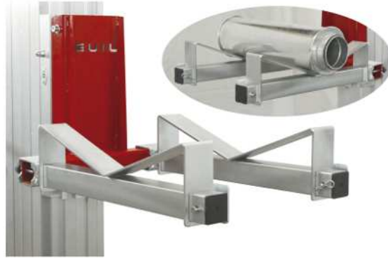
ACT-01 PIPE CRADLE