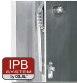
Internal Pendulum Brake System (IPB)