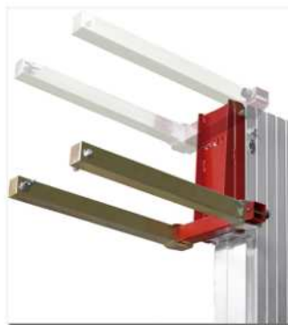
Reinforced forks included. (Detachable). Reversible & Adjustable design.