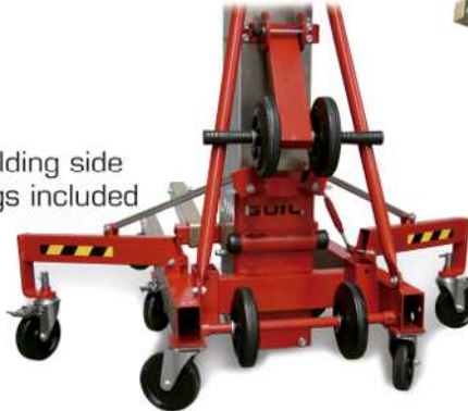
Folding side legs included